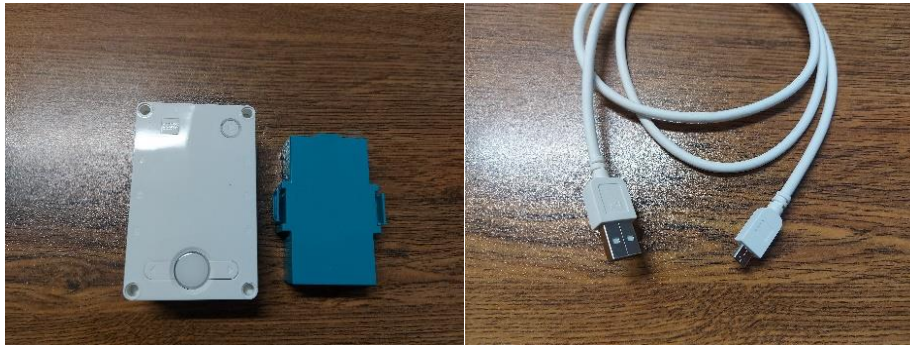
1 Lego Power Bank