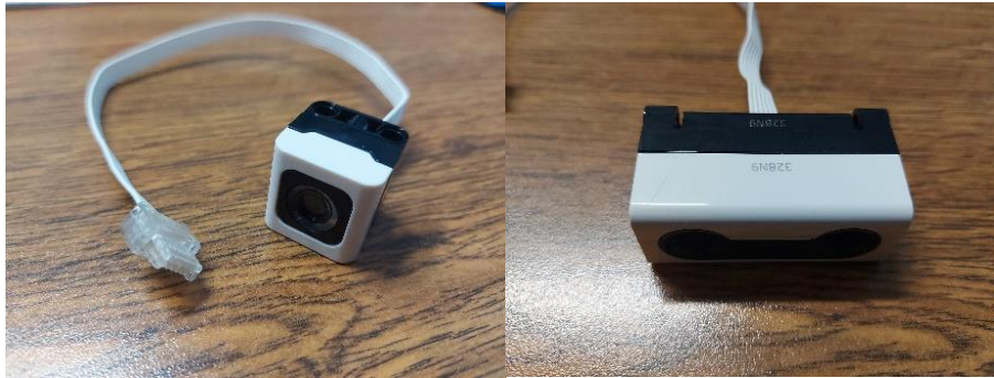
1 Lego Camera